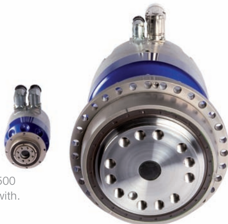
New dimension: TPM+004 and TPM+500 show the high bandwidth.

Two negatives make a positive: Low levels of operating noise due to helical teeth and outstanding control properties ensure greater precision in your machines and plants. The result: Genuinely economical products.